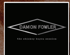
DAMON FOWLER THE WHISKEY BAYOU SESSION