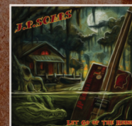
JP SOARS LET GO OF THE REINS