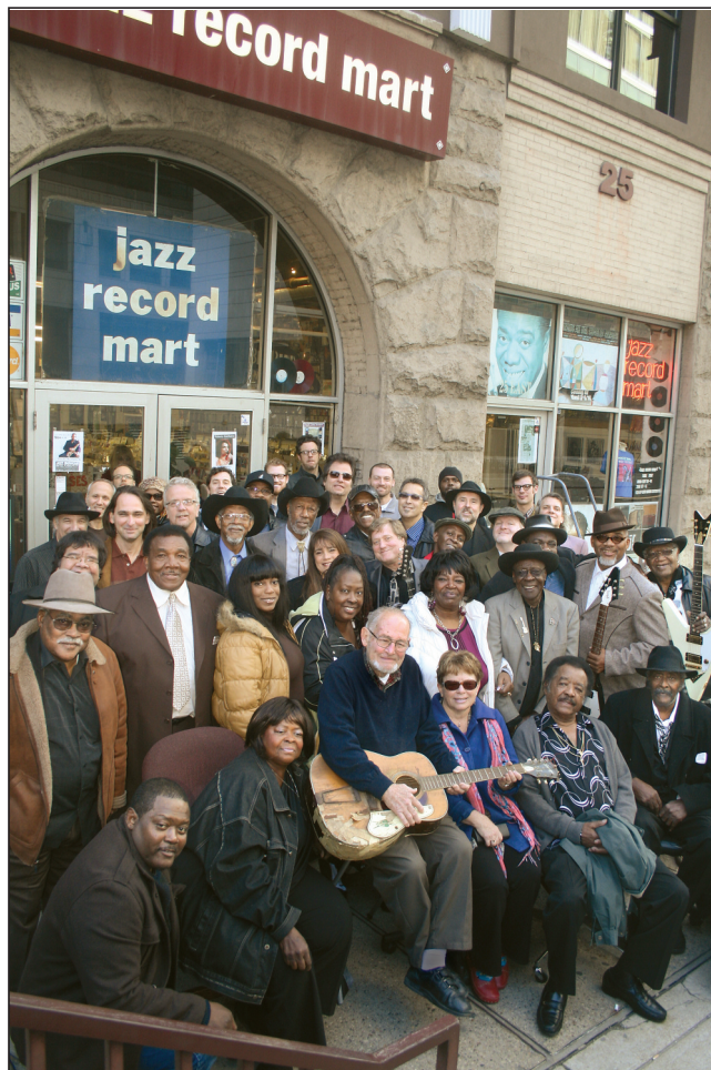
Chicago is full of wonderful Blues people at Delmark's headquarters in front of the old Jazz Record Mart, November 22, 2012.

I have a great group of photographers to work with as you can see from this