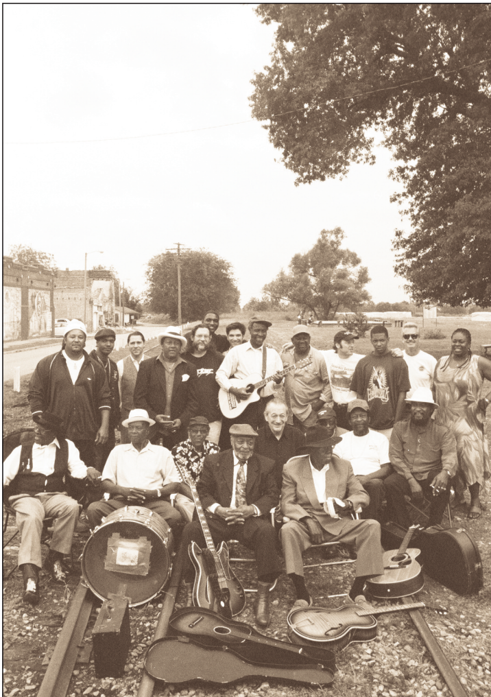
My favorite photo of my work - Robert Jr. Lockwood and friends, "Waiting for a Friend(s)" in Tutwiler, Mississippi where the blues was born - October 12, 2003.