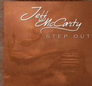
JEFF MCCARTY STEP OUT